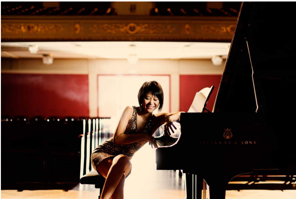
Pianist Yuja Wang at Konzerthaus Wien

Subscriptions to the TSO’s 2026/27 season are now available.