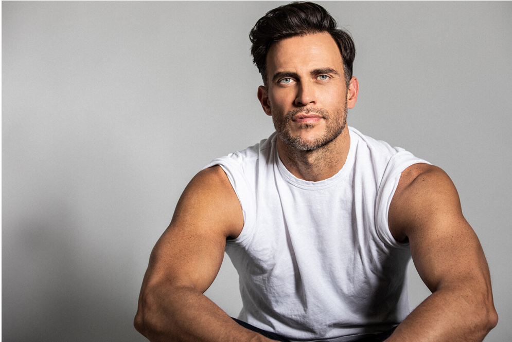
Vocalist Cheyenne Jackson