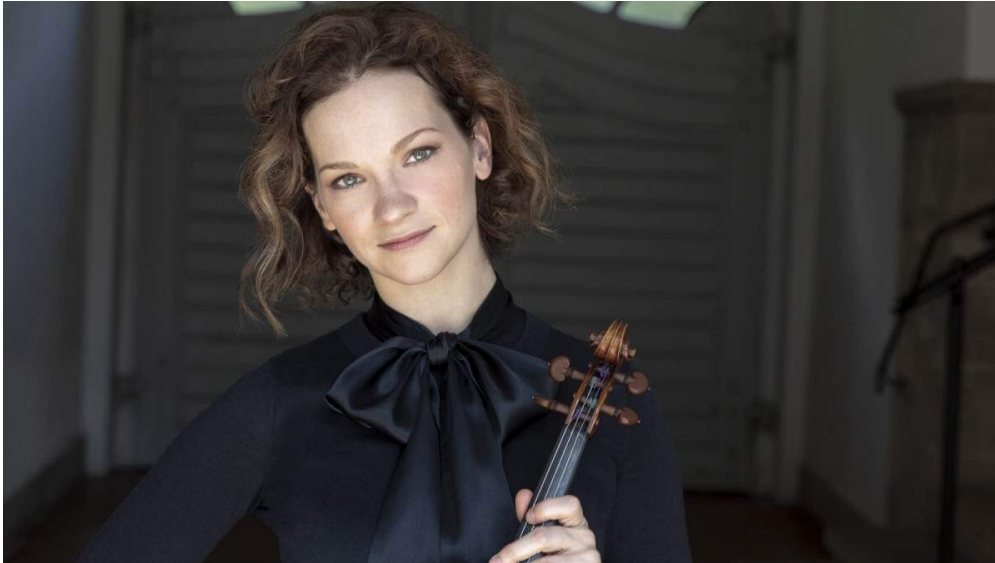
Violinist Hilary Hahn