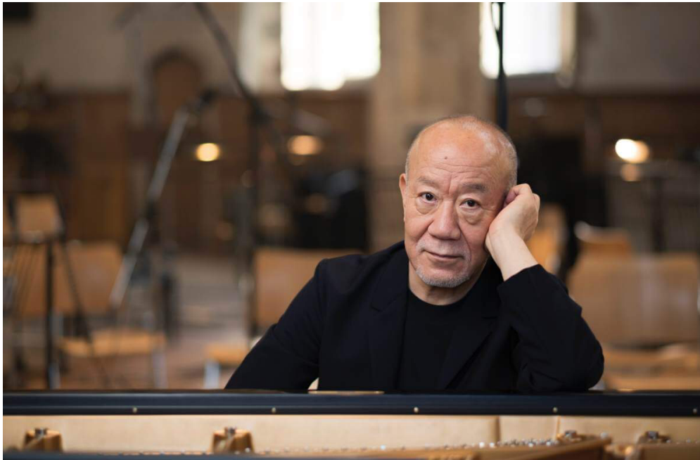
Joe Hisaishi, Composer And Conductor